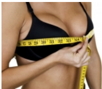
The Edit: Chinese restaurant gives discounts according to boob size