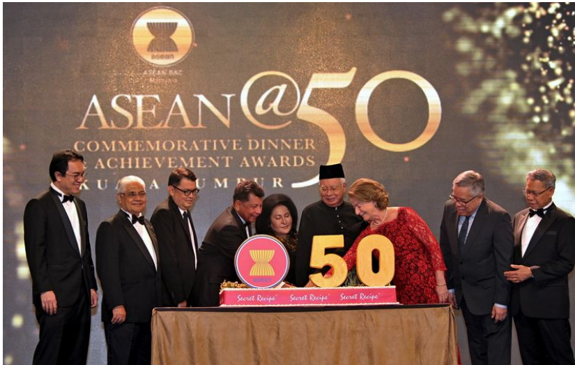
Prime Minister Datuk Seri Najib Razak (fourth right) and wife Datin Seri Rosmah Mansor with some invited guests cutting the cake during the Asean @ 50 and Award Presentation Awards in Kuala Lumpur, August 4, 2017.

TOOLS INCREASE TEXT DECREASE TEXT RESET TEXT PRINT ARTICLE