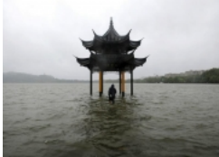
The Edit: 2016 weather report — extreme and anything but normal