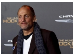
The Edit: Woody Harrelson talks his new film 'The Glass Castle'